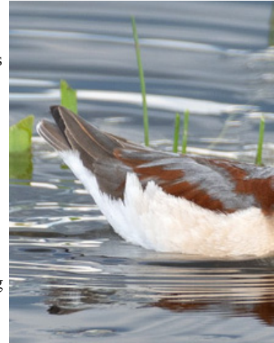
A female Wilson's Phalarope

Then we headed up into the junipers and sagebrush hills just above Frenchglen where we got onto a pretty Green-tailed Towhee, a large and smartly-attired sparrow. Cassin's Finches were coming to a mud puddle for water while we got onto both Gray