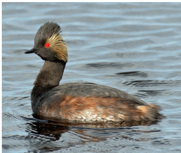
Eared Grebe in breeding plumage at Malheur NWR.

On our long drive to Yakima, we made one last birding stop about an hour north of Burns at Starr Campground in the Blue Mountains south of John Day. Here we took a walk through the campground in a dry-side forest of Ponderosa Pine, Douglas-fir, Grand Fir, and occasional Western Larch. Along the walk, I employed a century-old technique of playing tooting calls of the Northern Pygmy-Owl, arch enemy of small forest birds. It turns out in bright sunlight, forest birds are quite confident of outwitting this bluebird-sized predator. Soon, birds were flocking to us from all directions, 10 or so species in