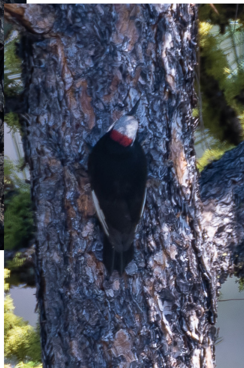
Left: A very uncooperative male White-headed Woodpecker in the Meeks Burn. It just refused to present a nice pose.