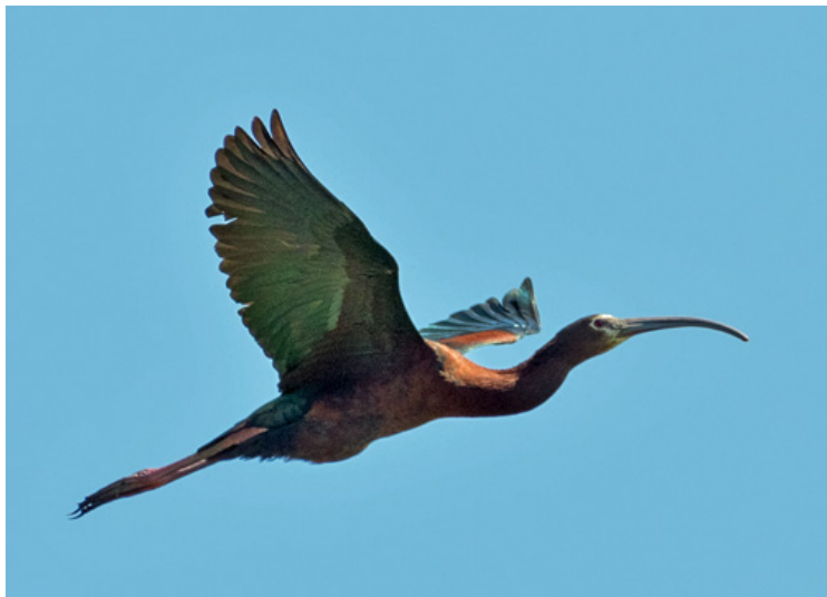
White-faced Ibis in flight.

In drier shrub-steppes above the marshes we made a short stop for birds of the sagelands and were rewarded with the Brewer's Sparrow and Sage Thrasher. I mentioned the overwhelming cover of weedy invasives, especially Cheatgrass, which depresses popu-