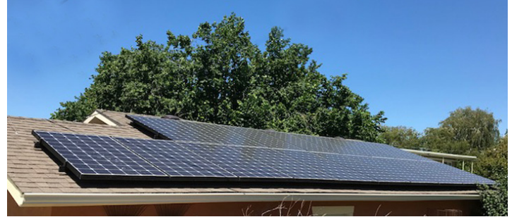
Solar panels on a YVAS member’s garage

Although there were four carbon pricing bills put forth