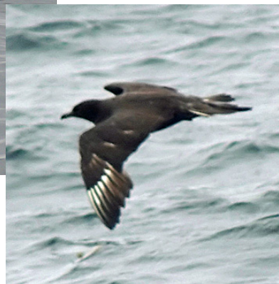
Northern Fulmar (right)