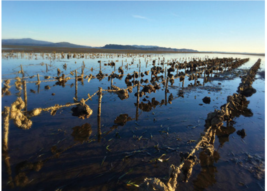
Oyster Farm in Willapa Bay, Pacific County, WA