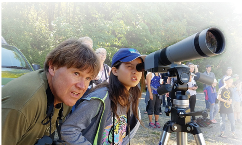
Young urban Naturalist scoping a feathered friend.