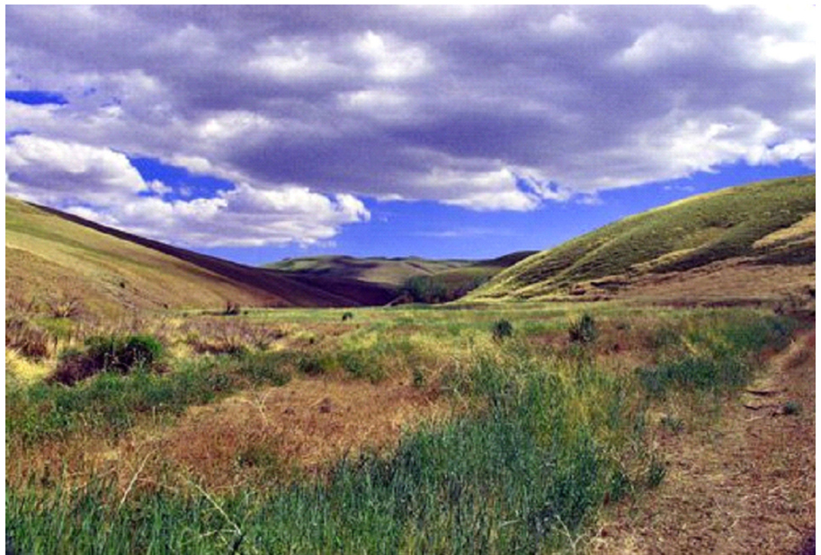
The Shrub-steppe Audubon is working to preserve.