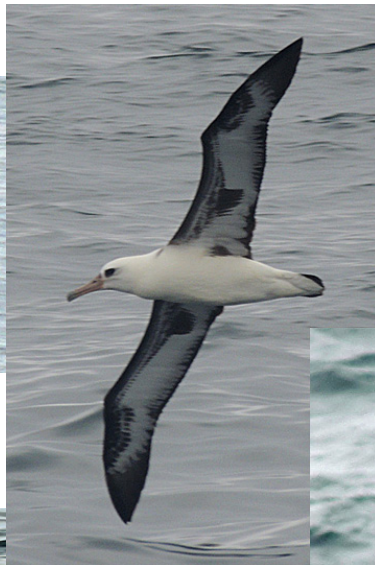
Laysan Albatross (left)