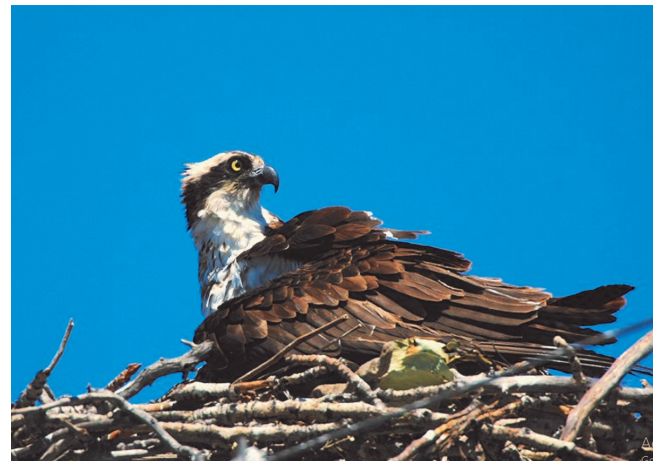
Osprey

I don’t travel much, but I don’t think you can take a main road out of Yakima proper without passing an Osprey nest. And the time is right...soon most of those nests will flick on the No Vacancy Sign. Get out there and enjoy the Year of the Bird, after all this is the centennial of the Migratory Bird Treaty Act, the most powerful and important bird protection law ever passed.