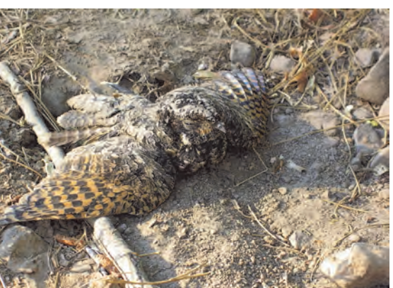
Common Poorwill in the Wenas Campground

As of April 9, the Blue Jay that was hanging out near