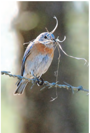
Female Western Bluebird patiently waits for monitors to finish at Box 39A.

well as shore up the support of pect on cleanout day.