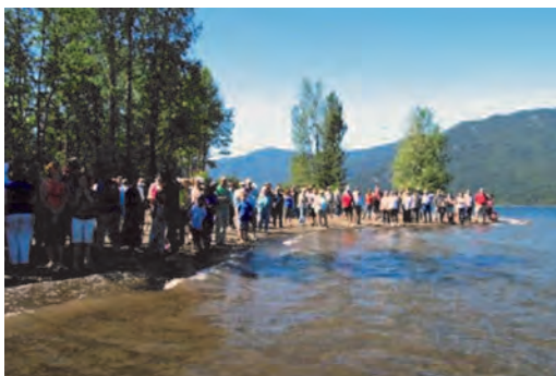
People line the bank to witness the First Return: Sockeye Ceremony. July 10, 2013