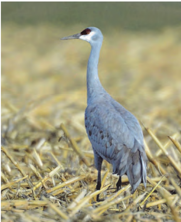
Sandhill Crane

Sandhill Crane in the Yakima area during winter.