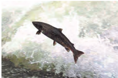
Salmon Migrating Upstream

Historically there were six stocks of Pacific salmon produced in the Yakima Basin that had an annual return from 700,000 to one million adults. All of these populations were dramatically reduced by the late 1900s due to over fishing, logging, irrigation and hydropower dams and other anthropogenic causes. The spring Chinook, fall Chinook and steelhead stocks persisted, but with total returns of less than 10,000 adults in the 1980s and 90s. Sockeye went extinct in the early 1900s as each of the four natural lakes that produced them were dammed for irrigation water storage. The summer Chinook and coho went extinct in the 1980's. The Yakama Nation has worked to reintroduce each of these species back into the Yakima through