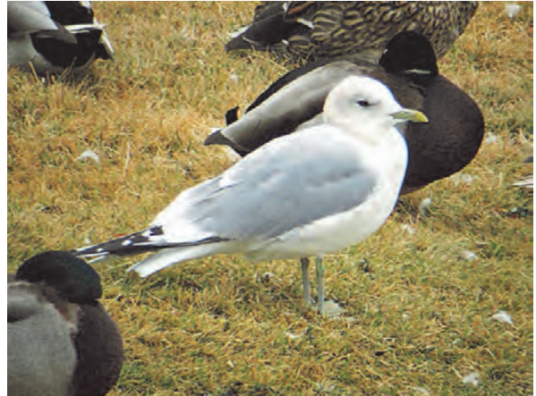
Mew Gull at the Union Gap Costco Pond