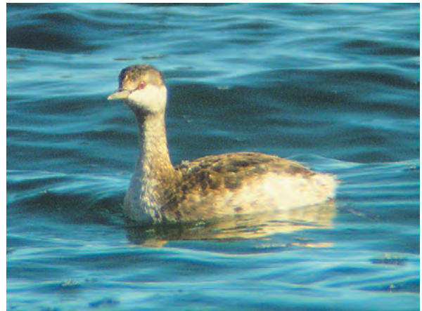
Horned Grebe