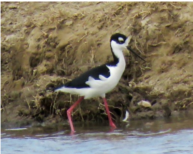
Photo Black-necked Stilt.