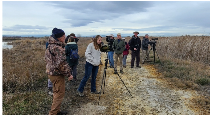
Photo Field trip to Sunnyside.

above the nest. In the cattail and tule marshes, Marsh Wrens were singing everywhere but close looks at this secretive bird mostly eluded us. Virginia Rails were calling up a storm from the marshes, too. Perhaps even more secretive than the Marsh Wren; with a little coaxing, a rail scurried across an opening in the marsh, giving us fleeting views. Yellow-headed Blackbirds were back from the south, also, singing their most unpleasant squeaky gate song. Tree Swallows, early spring migrants, were hawking insects over the ponds.