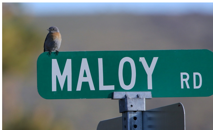
Photo A female Western Bluebird greets us in the parking lot before the cleanout.

On April 8, a hardy and fun group of volunteers gathered for the annual cleanout of the boxes. It was a great day.