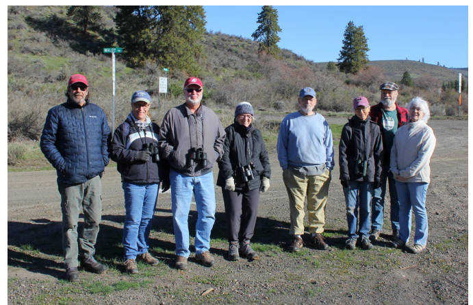
Photo Volunteers gather (and do a little birding) before starting out.